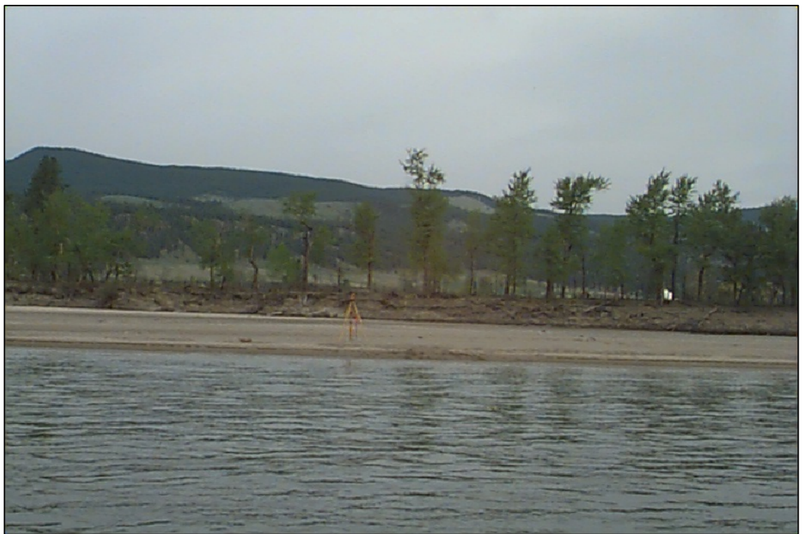
RIGHT BANK VIEW