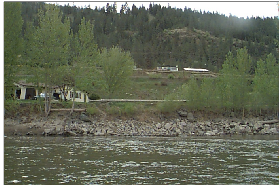
LEFT BANK VIEW